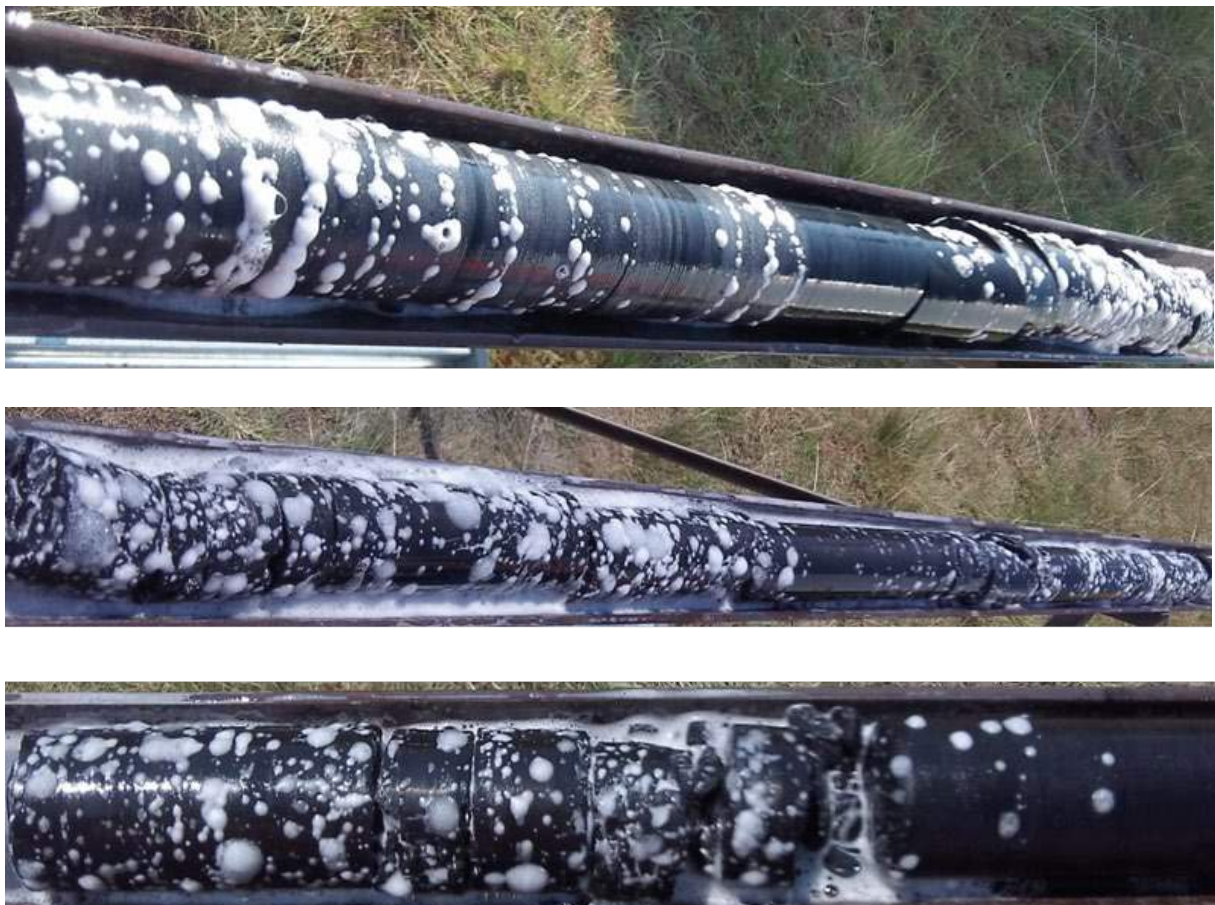
Figure 1: Core well 270-05C visible gas emissions observed from representative core samples at depths between 175-287m

The Company is aware, from aeromagnetic and gravimetry surveys, that the dolerite sill undulates and, in some cases like this one, creates multiple caps. However, recent and historic drilling gives the Company confidence that thicker cumulative sills can mean a combination of shallow and deeper sands and therefore the terminal depth (and potential associated gas pay cut in the profile) of this core hole could be similar to recent core holes (270-03C - 158m of gas-bearing sediments) with a similar terminal depth.